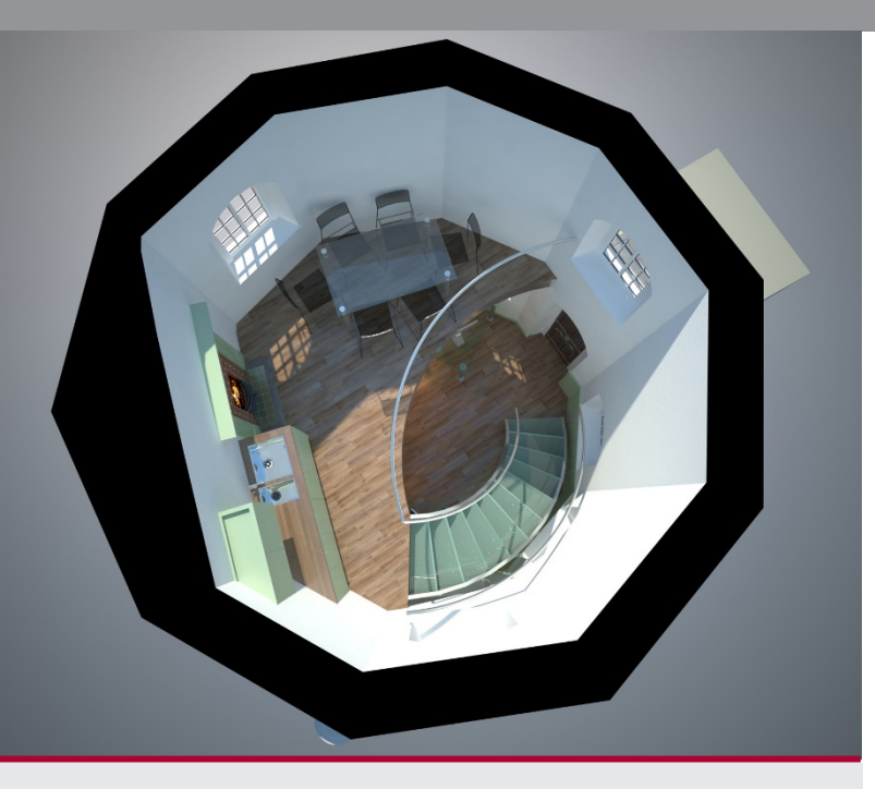
The restoration has preserved the historic building fabric and provided it with a new use as office space at ground floor and mezzanine level.

Due to the exposed surface, key criteria for the tollhouse roof included achieving a firmly adhered, free draining and weather tight membrane. Resistance to wind loads was another factor in the specification.