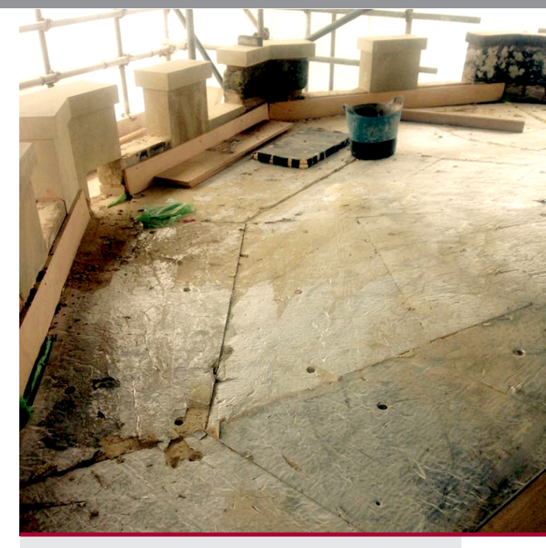
Hydrostop AH+ was used as an alternative to lead traditionally used on buildings of this age - due to its ability to be used on a shallower pitch.

Hydrostop AH+ is fast-curing and easy to apply. Its superior performance makes it ideal for any