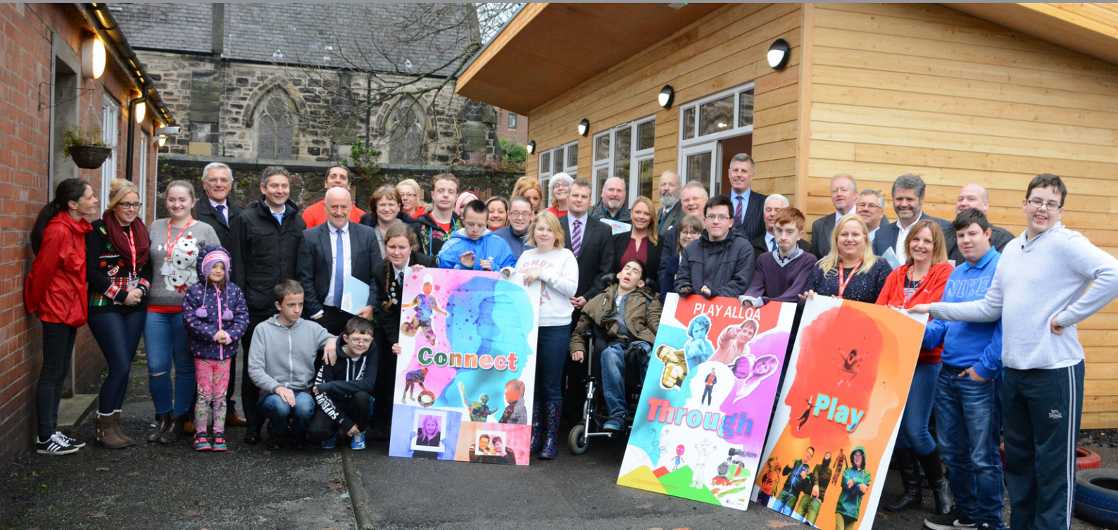
Doing our bit for the Play Alloa children's charity #ourweebigbuild

Project: Play room for Scottish children's charity